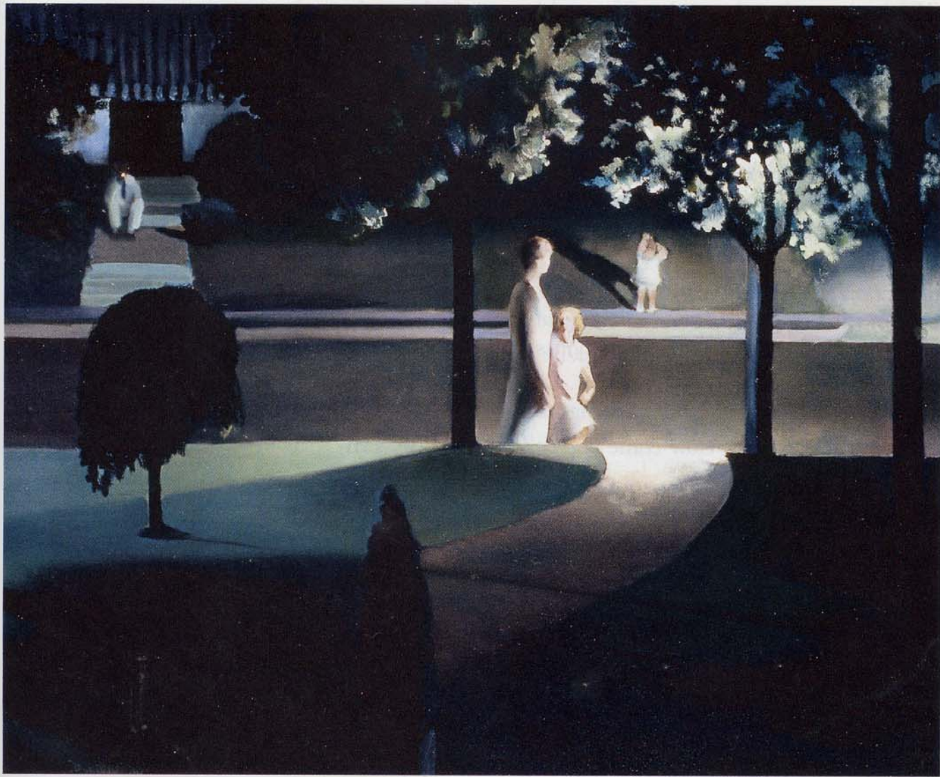
Streetlight, 1930, Constance Coleman Richardson, Indianapolis Museum of Art

▲ Critical Viewing Why does night's darkness, shown in this illustration, make people more fearful? [Hypothesize]