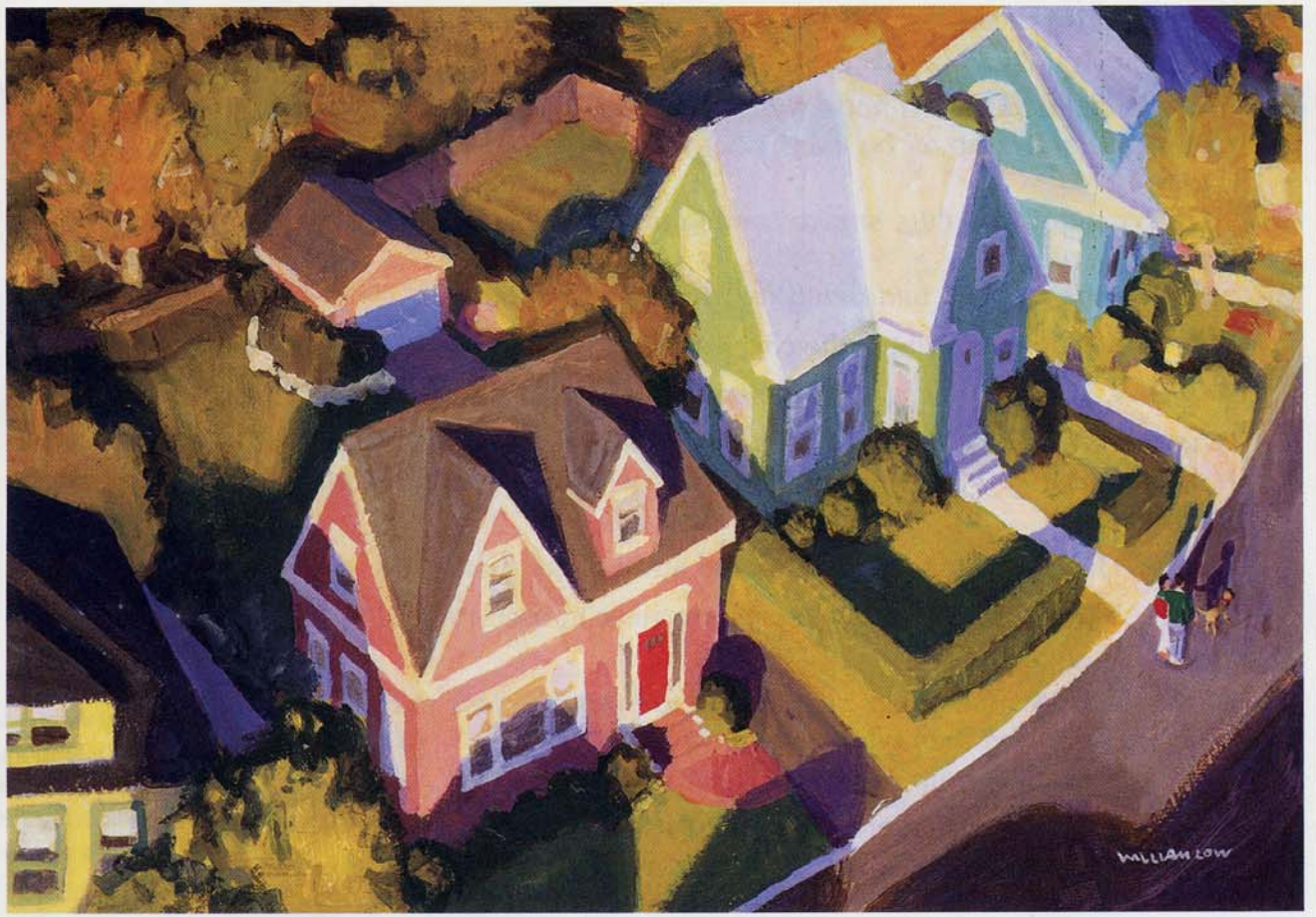
Overview of family walking dog on the street

DON. Maybe you better tell us. Nothing's working on this street. Nothing. No lights, no power, no radio. [ And then meaningfully ] Nothing except one car—yours!